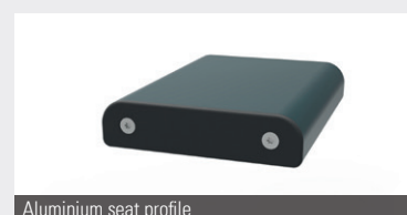
Aluminium seat profile